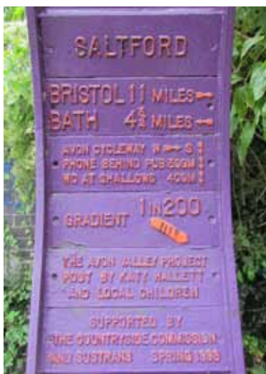
Information post at Salford

By 1983, Cyclebag had evolved into the charity Sustrans, still led by John Grimshaw. The Bristol and Bath Railway Path was the first cycle route created by Sustrans. Since then, Sustrans has created many more cycle routes across Britain, often making use of disused railway lines like this one. Individual routes were gradually joined up to make over 10,000 miles of designated cycle routes – the National Cycle Network.