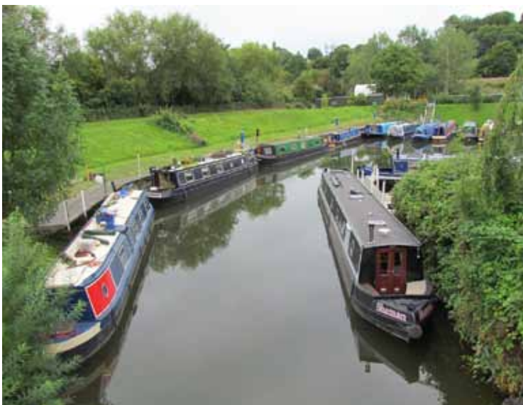
Narrow boats moored at Saltford Marina

And there are two railway lines – Brunel's Great Western Railway, still the main Bristol-London route, and the now-defunct Midland line, which was converted into Britain's first Sustrans cycle track in the 1980s.