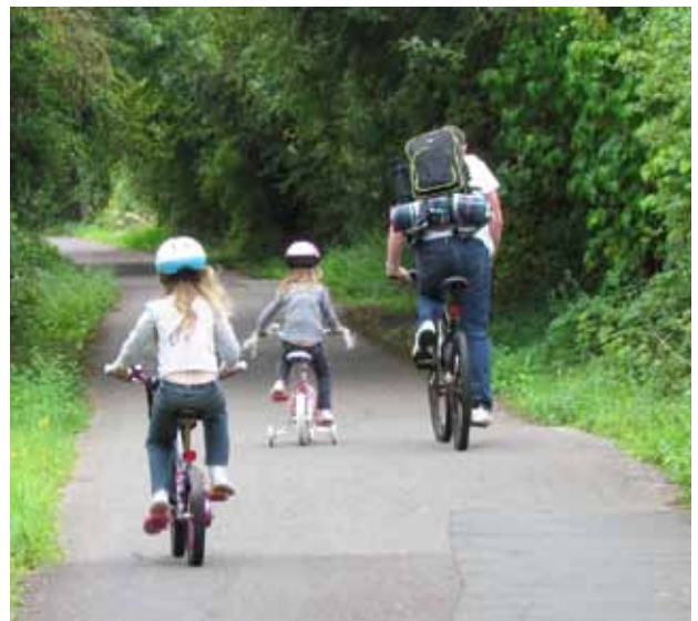
Bristol and Bath Cycle Path at Salford Bridge

In 1979, the group obtained planning permission to create a 2 metre wide dust track on the abandoned line between Bath and Bitton. Then, with the help of the county council, the group leased more of the line. And between 1979 and 1986, they constructed a cycle track on the full 13 mile length.