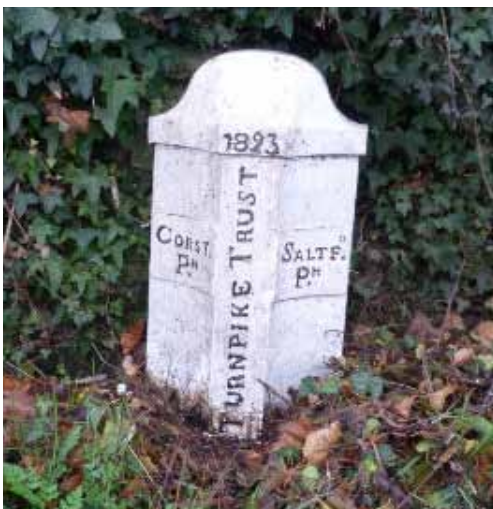
An 1823 Turnpike Trust milestone near Saltford

As Bath became more popular with the wealthy and famous, Turnpike Trusts were set up under the terms of the Turnpike Acts to pay for maintenance to the road.