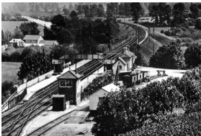
Saltford station c. 1920

Chris: Saltford Environmental Group was formed in January 2011 and by July 2011 we were ready to have our first public meeting to gauge public opinion about whether the villagers would like their station back. It was an overwhelming success – we had 140 people turn up – and we were all singing from the same hymn sheet. So the current situation is we have political support at Bath and North Somerset Council and we are about to launch a doorstep petition just to get a body of opinion which we can then present to various people who will ultimately make the decisions. But as a lobby group, we've had incredible success in a very short space of time and I'm very hopeful that we can achieve our ultimate aim of, within five years, having our station back.