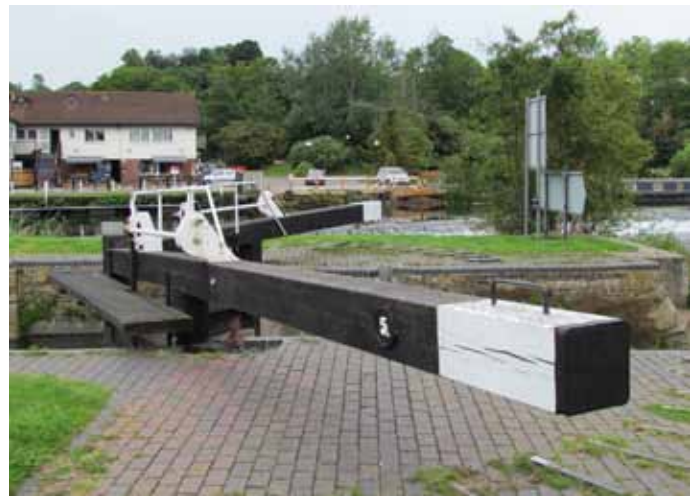
Kelston Lock on the canalised River Avon

In the days before the Industrial Revolution, anyone wishing to move goods across the country had to entrust their merchandise to jolting carts or pack animals on deplorable roads. The Bath Corporation were keen on various schemes to make the Avon navigable as far as Bath because road transport from Bristol was difficult and expensive “by reason of rockie and mountaynous waies”.