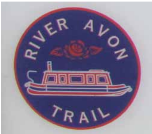
River Avon Trail logo

Now this former working routeway, where men sweated and toiled, is a designated footpath – the River Avon Trail. The trail runs 23 miles from Pulteney Bridge in Bath – upstream along this valley – through Bristol and to Pill in North Somerset. At this point the trail is on the south bank, opposite to where we are now.