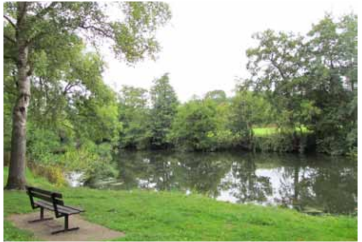
A peaceful stretch of river – The Shallows, Saltford

It could mean 'Salt Ford', because in those days there were no weirs on the River Avon and water here could have been salty, whereas, the tidal salt water did not reach the riverside village of Freshford, on the Avon to the east of Bath.