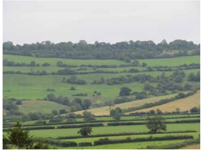
The horizontal hedgerow on the hillside marks the Roman road between Aquae Sulis (Bath) and Abonae (Sea Mills)

Like the modern routeways that we have looked at, this ancient routeway also follows the line of the Avon valley, but the major difference is that it is positioned on the rim of the valley rather than in the bottom of the valley.