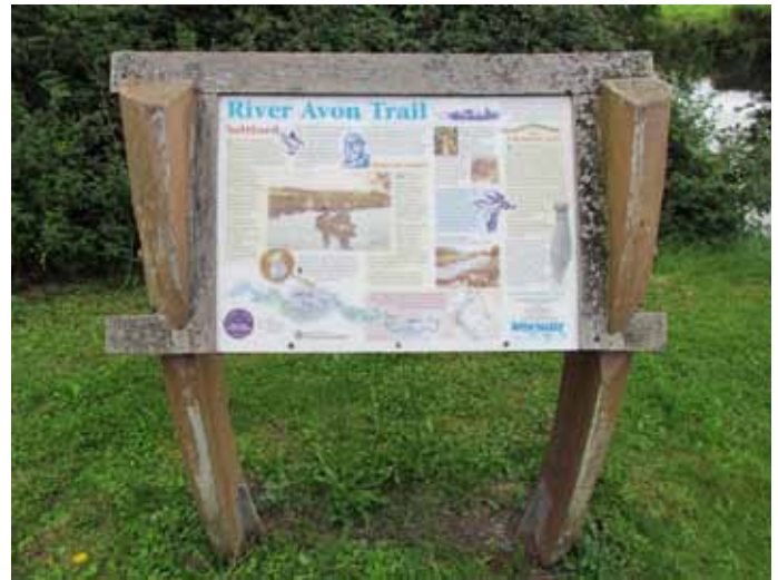
River Avon Trail information board at The Shallows

As we heard earlier, when the river was made navigable in the eighteenth century, boats were hauled by men. They walked along towpaths on the bank dragging ropes attached to the barges and boats.