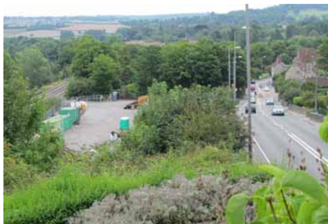
Site of Saltford station 2010