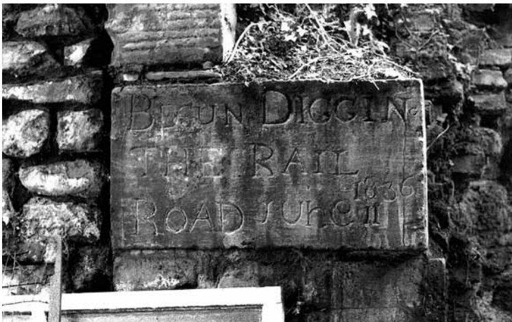
“Began Digging the Rail Road June 11 1836” Historic graffiti found at Saltford Brass Mill

On this stretch, the line parallels the River Avon. To maintain a low gradient, it runs over the flood plain on an embankment and in cuttings through the valley sides. The rock in this cutting – blue and white Lias limestone – is laminated by mudstone (in other words, clay). This is a combination that is unstable, causing frequent landslips. It is a hazard that faced Brunel 170 years ago and is still present. Preventative work in the cutting has cost Network Rail – we reckon – over £10 million pounds over the last ten years.