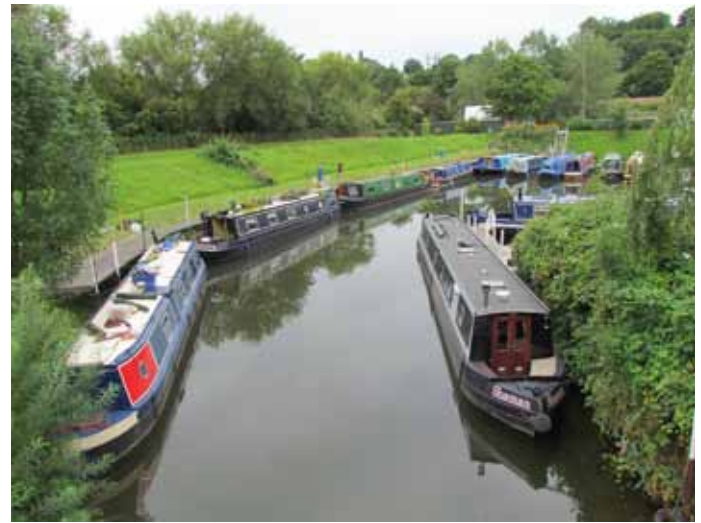
Salford Marina

Just as the rail line we saw was transformed from a commercial routeway to a leisure routeway, so too has the main function of the river altered from one of trade and industry to one of pleasure and recreation. Salford Marina, across the river, is one of several examples along this stretch of the river of this changed usage. The marina is a family-run business with 85 moorings on the river front and within the marina. There are residents who live on boats all year round and commute into Bristol and Bath, as well as holiday boats and day trippers.