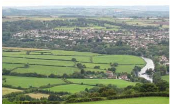
The Avon Valley at Saltford

This is the Avon Valley, a busy but beautiful area on the southern edge of the Cotswolds Area of Outstanding Natural Beauty. The valley has a key position between the two cities of Bristol and Bath and this walk explores the routeways created to link the two cities and support various industries and economic activities in the area.