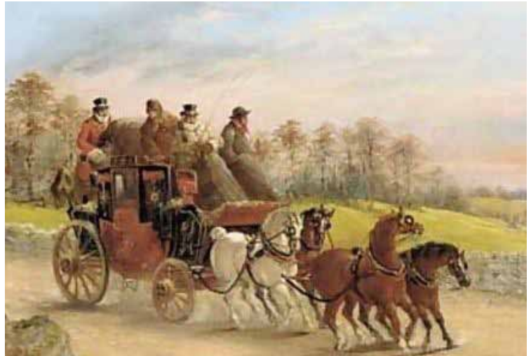
A Bristol to London mail coach with a hunt beyond Oil painting by John Charles Maggs http://www.wikigallery.org/ (Creative Commons License)

This is the A4, a road that runs all the way from Trafalgar Square in London to Avonmouth via Maidenhead, Reading, Newbury, Chippenham, Bath and Bristol. It used to be called The Great Road. This routeway has gone through many transformations through the ages – from Roman roads to basic wagon tracks connecting market towns in the Middle Ages.