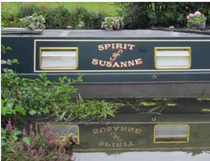
Narrowboat at Salford Marina