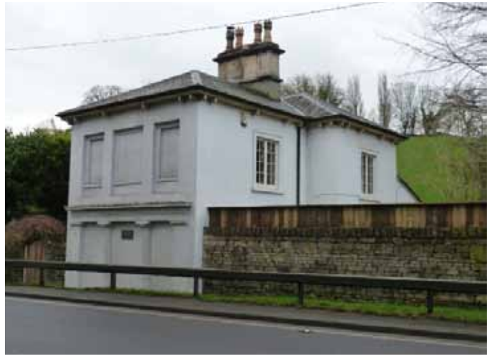
The Toll House on the A4 is now a private house

In the twentieth century, the A4 lost its status as the primary road between London and Bristol. The M4 motorway was constructed between 1965 and 1971. Journey time from London to Bristol by car is now about 2 hours – quite different from the days of the mail coaches!