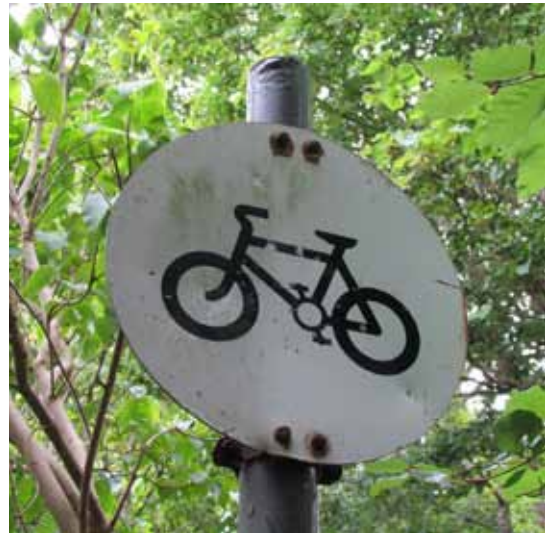
Cycle route sign

There is a former stagecoach road, The Great Road, now the present A4 and one of Britain's busiest A roads. There is the River Avon, which was converted into a canal in the eighteenth century, although it is used now by narrow boats for holidays rather than by barges carrying coal.