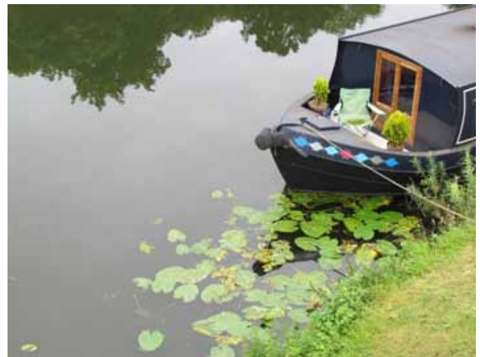
Narrowboat at Salford Marina