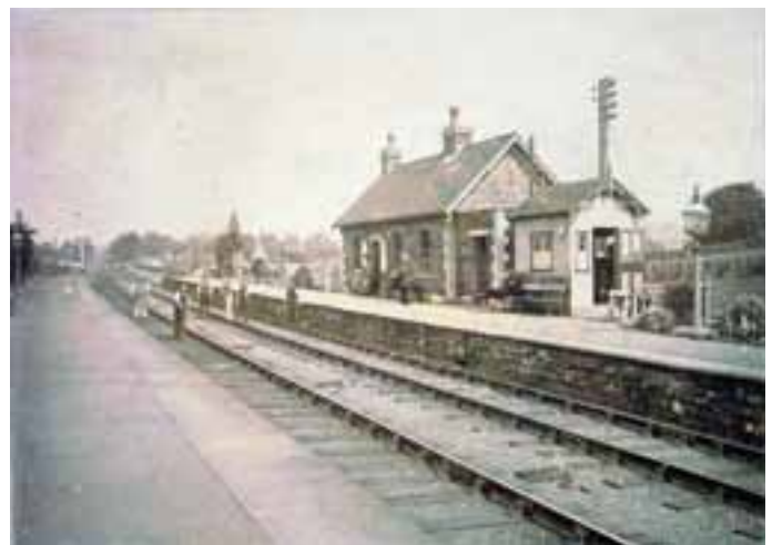
Kelston station